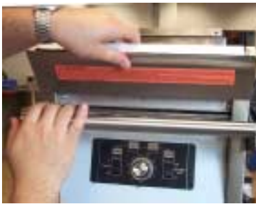
Fig: 2 Remove top cap.